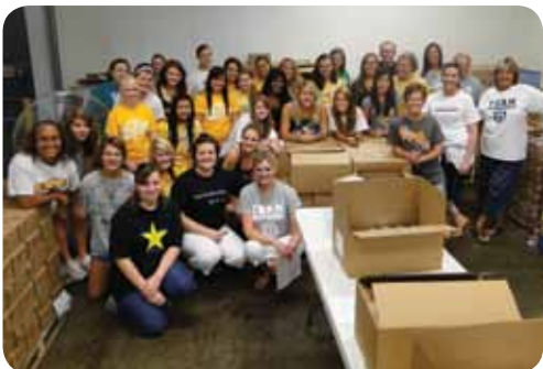
▲ 35 volunteers from Rasmussen College and Fargo South's Cheer Team spent an afternoon at the Great Plains Food Bank packing relief boxes for those evacuated from their homes.