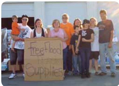
▲ Volunteers in Burlington, ND distribute 300 disaster relief boxes filled with food, grocery and cleaning supplies prepared by the Great Plains Food Bank for families in the region.

As part of our core business, we respond with support to local, regional and national disasters. We know the recovery process is long for families and communities and we are committed to assisting in all possible ways through the duration.